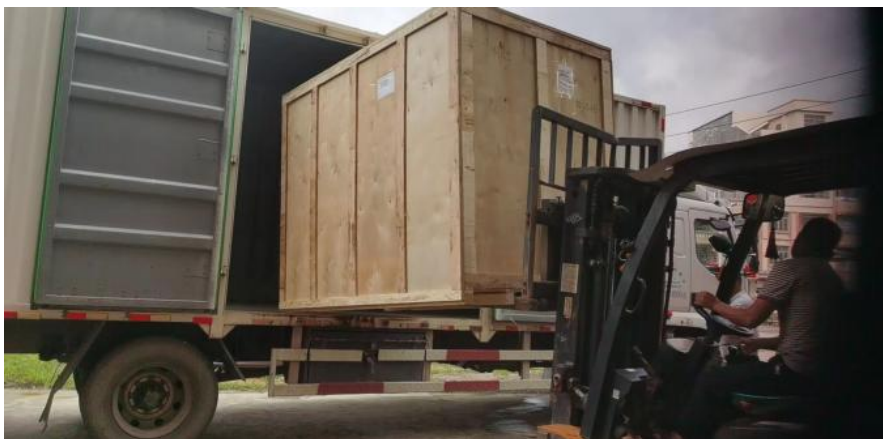
Packaging and exporting to the world